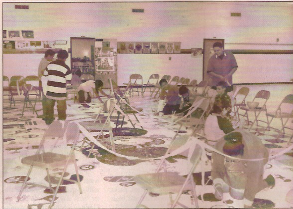
Students work on the Peace mural.