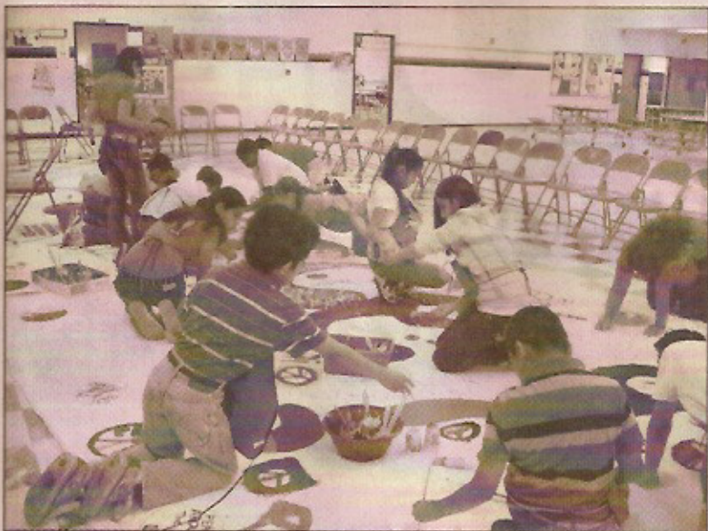
5th grade students work on the mural