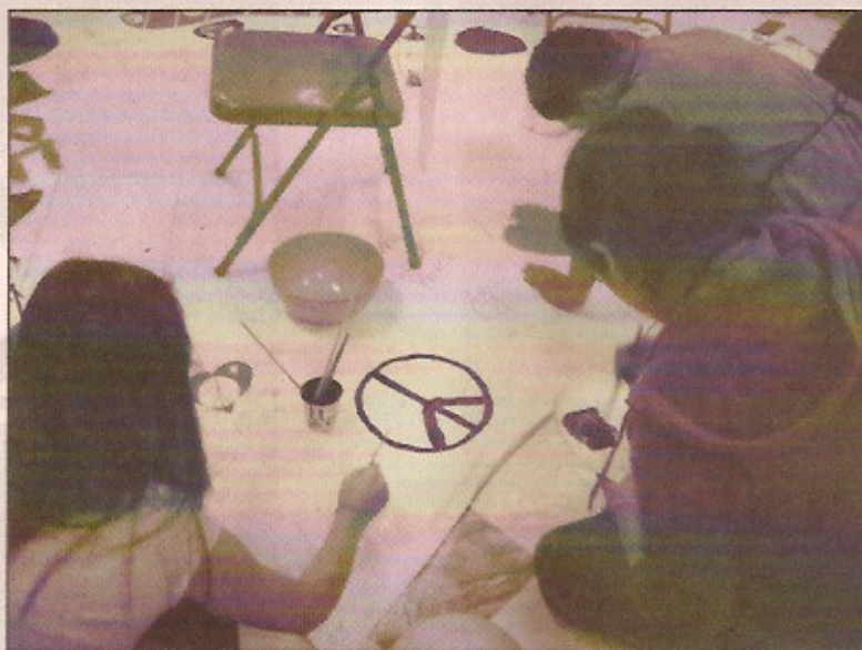
8th grade students work on the mural